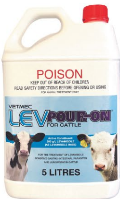
Vetmec LEV Pour-On