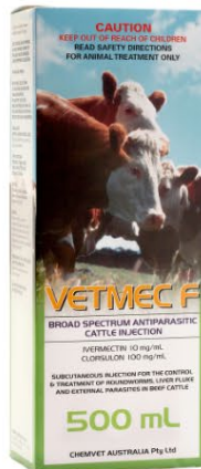
Vetmec F Injection