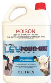
Vetmec LEV Pour-On