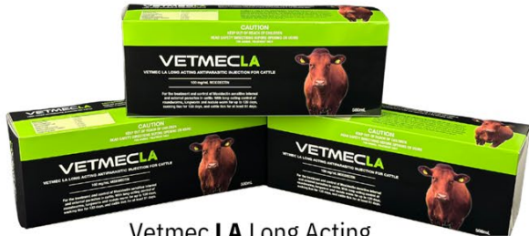
Vetmec LA Long Acting Injection