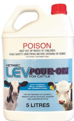
Vetmec LEV Pour-On