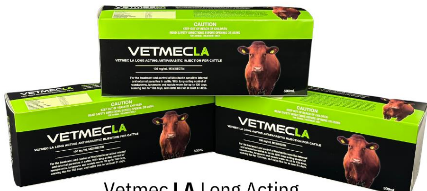
Vetmec LA Long Acting Injection