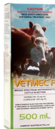
Vetmec F Injection