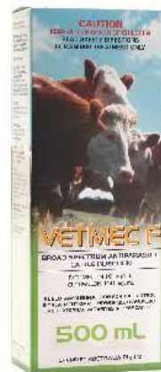
Vetmec F Injection