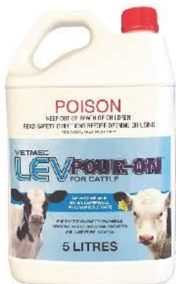
Vetmec LEV Pour-On