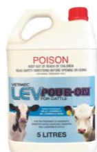
Vetmec LEV Pour-On