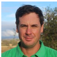
2nd vice president