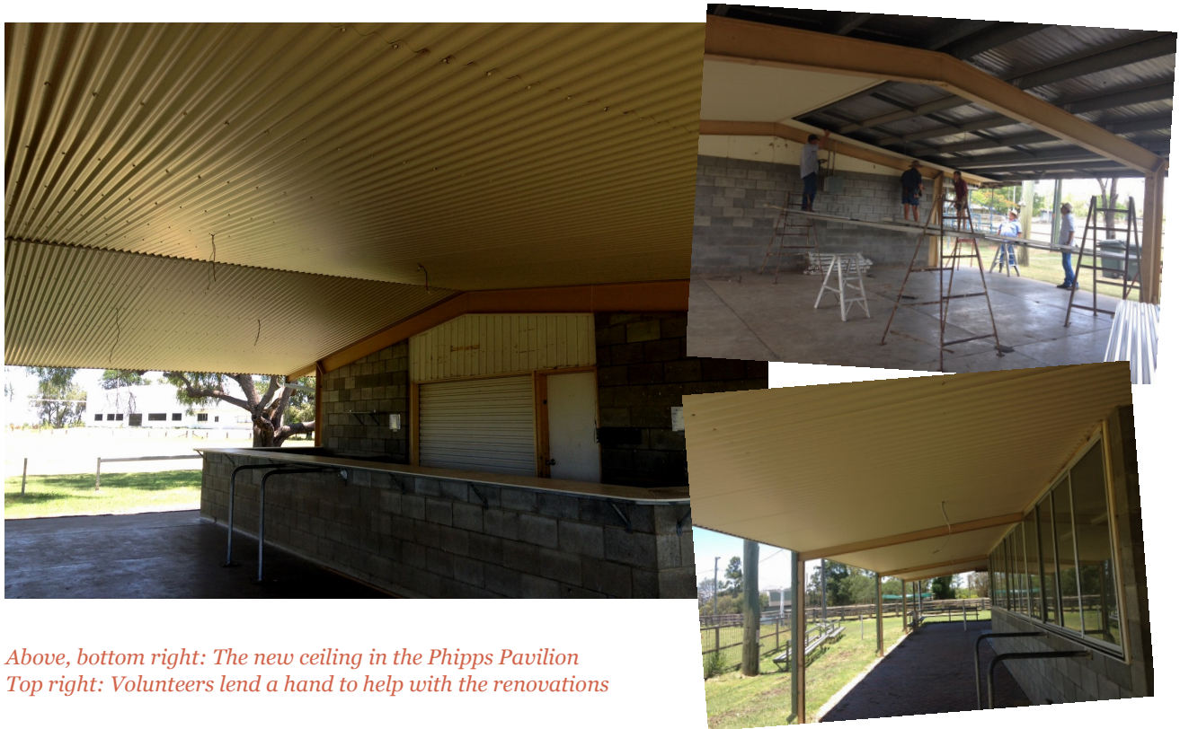
Above, bottom right: The new ceiling in the Phipps Pavilion Top right: Volunteers lend a hand to help with the renovations